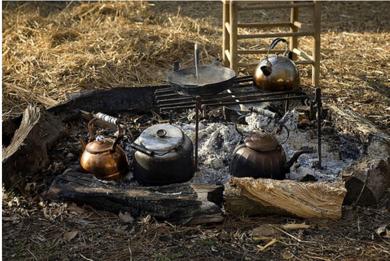
Battle of Bentonville reenactment. Civil War campfire.

Tar Heel Junior Historian Association, NC Museum of History