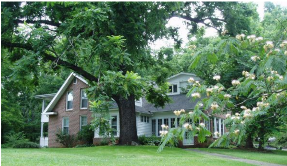
Photo is courtesy of the North Carolina Highway Historical Marker Program. This house is located at Lynn in Polk County.