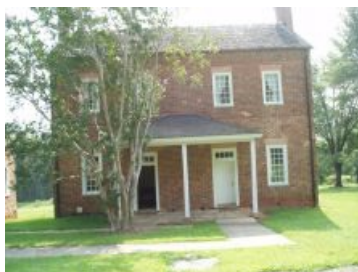
Quaker Meadows.

there is no record of his attendance. Archives & History.