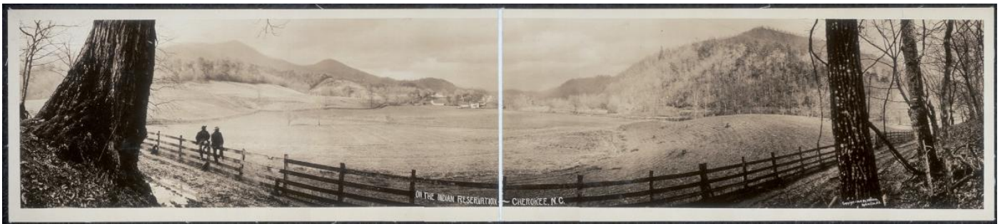
Library of Congress. c. 1909. "On the Indian reservation, Cherokee, N.C.