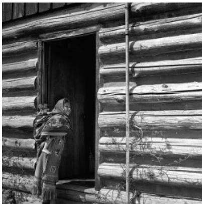
Mother and child in papoose on Qualla Boundary, 1941

In return for this peace, the British promised that no White settlements would be allowed west of the Appalachian Mountains. But land-hungry Whites ignored this promise and continued to settle on Cherokee land.