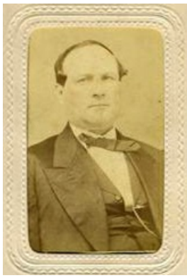
Photograph of Augustus Summerfield Merrimon, circa 1870-1880.