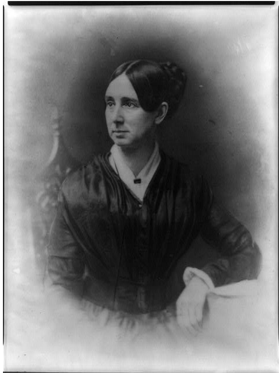
Dorothy Lynde Dix

Reprinted with permission from the Tar Heel Junior Historian , Fall 1996; Revised by SLNC Government and Heritage Library, June 2023 Tar Heel Junior Historian Association, NC Museum of History