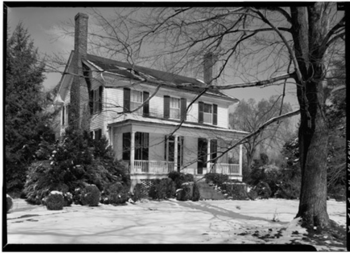
Photograph of the Nash-Hooper House, Hillsborough, NC.

In the summer of Prints & Photographs Online Catalog.