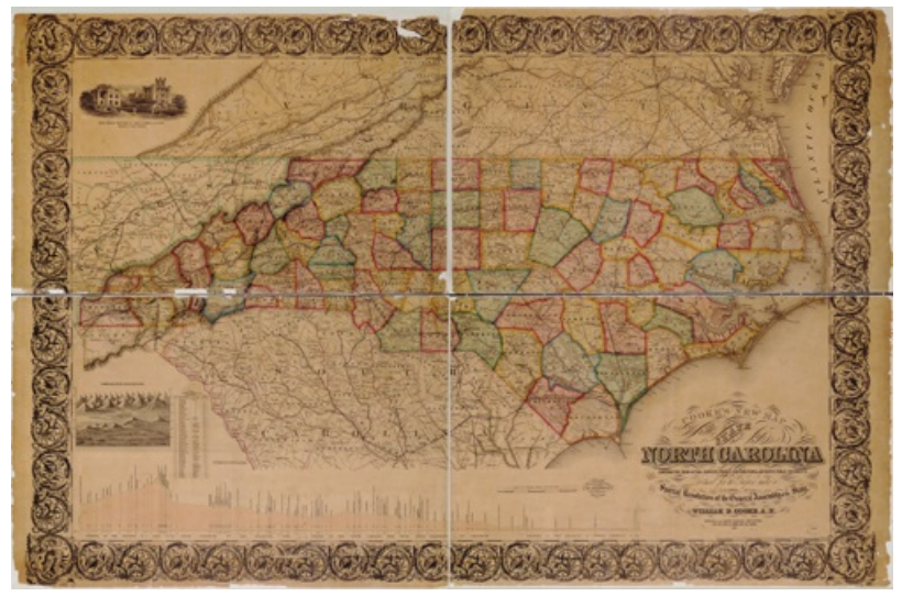
William Dewey Cooke and Samuel Pearce's "New Map of the State of North Carolina," published 1857.

<sup>[13]</sup>of the map, printed in soft, bright tones, was