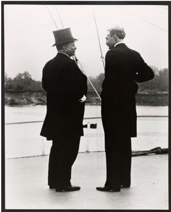
"President Theodore Roosevelt and Chief Forester Gifford Pinchot -- T.R. and G.P. -- on the river steamer Mississippi This picture was taken on the trip of the Inland Waterways Commission down the Mississippi River in October 1907."

Pinchot worked as a forestry consultant throughout the country. In 1897 he took a post with the U.S. Forest Service to make a survey of U.S. forest reserves. As part of his report, Pinchot suggested that a government forest service be established to protect and control forest reserves. In 1898 he accepted an appointment as head of the U.S. Forest Service with the title of forester, an office located in the Department of Agriculture.