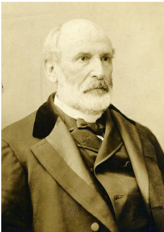
A 1900 photograph of Matt Whitaker Ransom.

At the close of hostilities Ransom returned to farming and the practice of law in North Carolina. In 1872 he won a seat in the U.S. Senate to succeed Zebulon B. Vance [14] , who had been elected but denied his seat because of political disabilities. He served continuously until 1895. In Washington Ransom acquired considerable influence even though he seldom delivered formal speeches on the floor of the Senate. He was a leader in securing a peaceful settlement to the disputed presidential election of 1876. A fusion of Populists and Republicans [15] in North Carolina brought about his defeat in 1895, but President Grover Cleveland at once appointed him minister to Mexico, a post he held for two years. Afterwards Ransom retired permanently to private life. He died on his seventy-eighth birthday and was buried on his estate, Verona [16] .