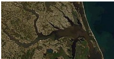
May 4, 2010. "Albermarle Sound, North Carolina."