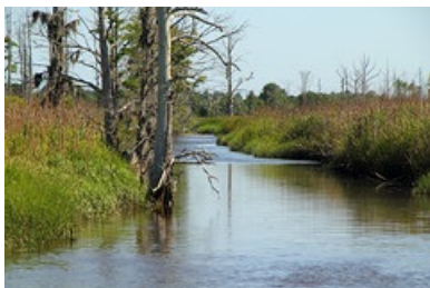
June 11, 2011. Wilmington, NC. "Cape Fear River Tributary." [33]

In the mid-1720s, the first permanent settlers arrived in the area around the lower Cape Fear River [34]. Their arrival was due mainly to the efforts of South Carolina planter Maurice Moore [35] and North Carolina governor George Burrington [36]. Moore had come to North Carolina to help fight the Tuscarora Indians. He became interested in settling in the Cape Fear area and encouraged others in South Carolina to settle there as well. Burrington ignored South Carolina's claim to land on the west bank of the Cape Fear River. Instead, he granted this land to settlers who left South Carolina to settle in North Carolina.