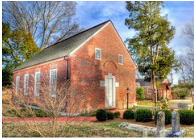
February 15, 2011. Bath, North Carolina. "St. Thomas Episcopal Church, Built 1734." [22]

In the late 1600s some settlers began crossing the Albemarle Sound to settle in the middle Coastal Plain [3], which stretches from the Albemarle Sound to present-day Duplin [23] and Onslow [24] Counties. By 1691 they had settled along the Pamlico River in Bath County [25].