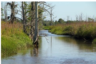
June 11, 2011. Wilmington, NC. "Cape Fear River Tributary."