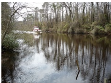
"Dismal Swamp Canal, North Carolina."