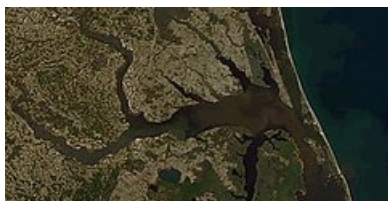
May 4, 2010. "Albermarle Sound, North Carolina."