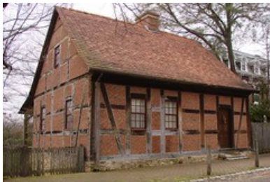
January 23, 2007. Downtown Winston-Salem, North Carolina. Old Salem in North Carolina. "One of the oldest houses in Salem. "

Moravians [13], also from Germany and then Pennsylvania, arrived in present-day Forsyth County [14] in 1753. They began building a well-planned, tightly controlled congregational community. Land was held in common, and crafts, occupations, and even marriages required approval from community boards. Salem [15] and its outlying settlements prospered and provided neighbors with mills, tanyards, shops, crafts, medical care, fine music, and other economic and cultural amenities.