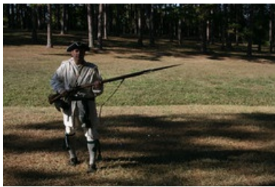
October 11, 2007. "Regulator Re-enactor with Musket and Bayonet." [20]

Eventually colonial Royal Governor William Tryon [21] raised an army that fought the Regulators [19] at the Battle of Alamance Creek [22] in 1771. The Regulators [19] were defeated, but their movement was an example of worsening tensions between the older eastern settlements and the rapidly growing backcountry to the west.