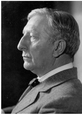
Professor William McDougall, 1938.