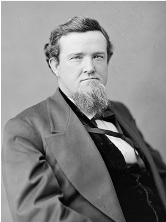
Photograph of Alfred Moore Scales, between 1865 and 1880.

See also: Alfred Moore Scales [1] , Research Branch, NC Office of Archives and History