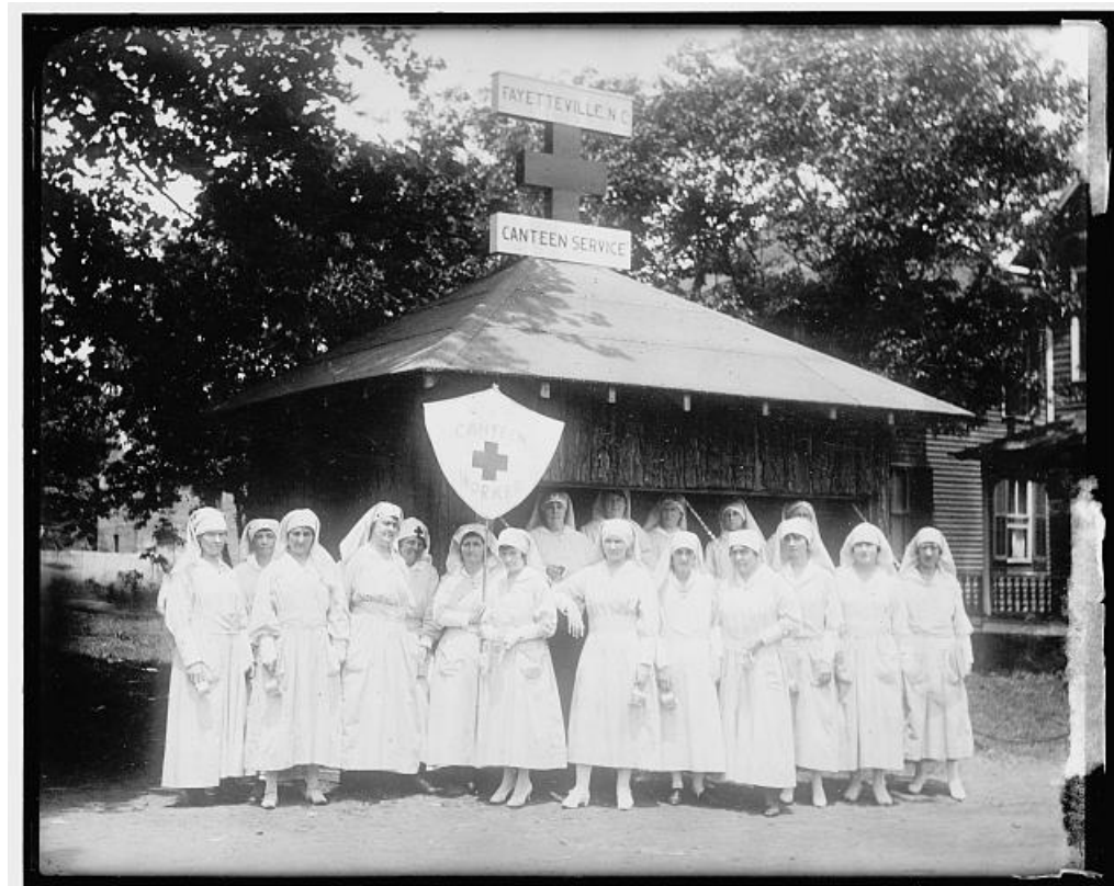
Fayetteville, N.C. Canteen Service. [Date created/published between 1910-1920]. American People"

See also: Great Depression [2] ; Public Schools in the Great Depression [3] ; 1920's [4] ; Agriculture During the Great Depression [5]