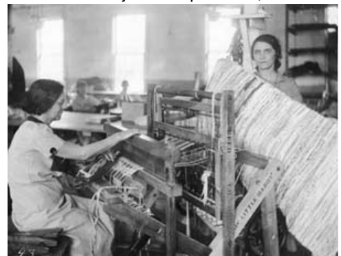
Women making rugs in Durham County, c. 1934.

Millions of Americans found themselves without jobs in April 1935, about six years after the stock market crash President