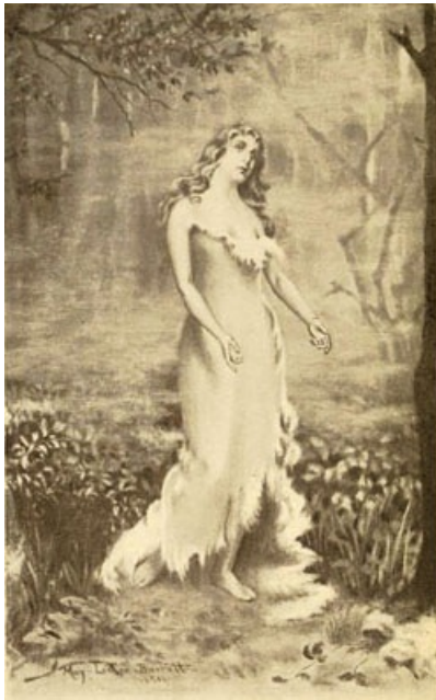
Illustration of Virginia Dare from Cotten's The White Doe .

[12] What happened to these "Lost Colonists"? No one knows for sure. As with many mysteries, when the answer cannot be found, legends grow to explain the story [13] . One of the most enduring North Carolina legends is about Virginia Dare as the white doe.