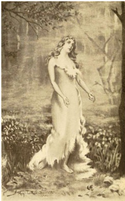
Illustration of Virginia Dare from Cotten's The White Doe .

[11] What happened to these "Lost Colonists"? No one knows for sure. As with many mysteries, when the answer cannot be found, legends grow to explain the story [12] . One of the most enduring North Carolina legends is about Virginia Dare as the white doe.