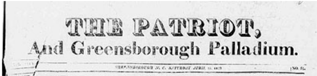
Image of masthead from The Patriot, and Greensboro Palladium," April 18, 1929.