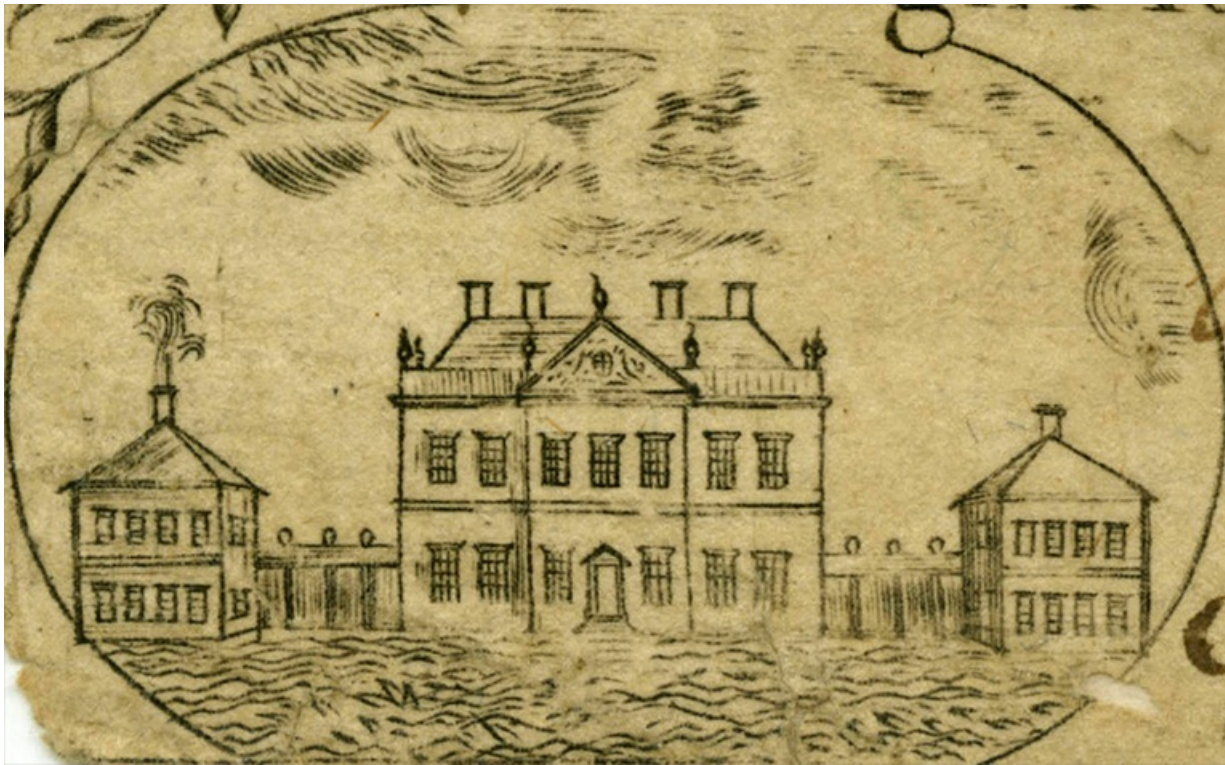
Detail of a 1775 North Carolina five dollar bill, showing Tryon Palace.

to pay for an expensive building. On 7 Dec. 1766 the Assembly passed by a large majority an appropriation of £5,000 with which to purchase lots in New Bern and begin construction. A month later Tryon and "John Hawks of Newbern Architect" signed a contract, and at the time Hawks estimated the total cost of the edifice and dependencies at £15,000. On 15 Jan. 1768 the additional money was voted. By mid-1770 the building was sufficiently completed for the Tryons to move in. The first Assembly session to use the structure convened in New Bern on 5 Dec. 1770.