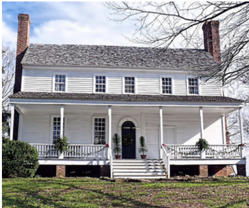
The House in the Horseshoe.