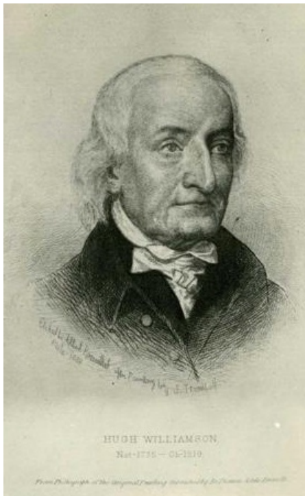
Hugh Williamson, drawn by Albert Rosenthal from a painting by John Trumbull.

[11] Doubting that he had the physical stamina required for a public speaking career and motivated by his own increasing personal disaffection with the growing theological debate between the orthodox Presbyterians and the New Lights, having been exposed to both through Alison and Finley, Williamson decided to leave the ministry and study medicine. Although licensed to preach, he was never ordained, nor did he ever accept the responsibility for a congregation. He first obtained a master's degree from the College of Philadelphia in 1760 and accepted an appointment to teach there while studying medicine.