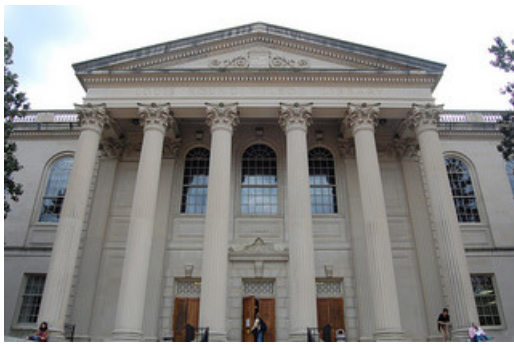
The Louis Round Wilson Library at the University of North Carolina at Chapel Hill.

[12] He left the University of Chicago in 1942 and returned to Chapel Hill, where he rejoined the faculty of the School of Library Science. He taught courses in university library administration intermittently until 1959, when he retired from the faculty at age eighty-three. Also assuming many committee responsibilities, he was director of the university's Sesquicentennial Celebration in 1944–46 and edited the thirteen volumes that marked that event. He served on the board of the University Press and the Institute for Research in Social Science. In 1951 he was appointed special assistant for development to the chancellor of the university, and in 1959, following his retirement from the faculty, he became special assistant to the president of The University of North Carolina system [13] . He retired from that post in 1969.