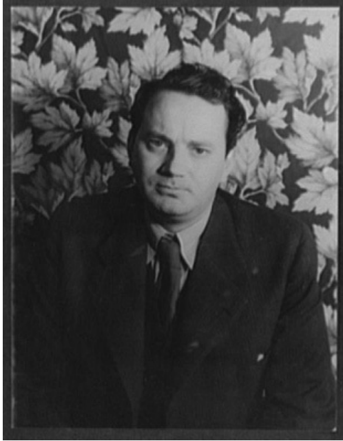
Van Vechten, Carl. 1933. "Portrait of Thomas Wolfe." Library of Congress, Prints & Photographs Division, Carl Van Vechten Collection, [reproduction number, e.g., LC-USZ62-54231].