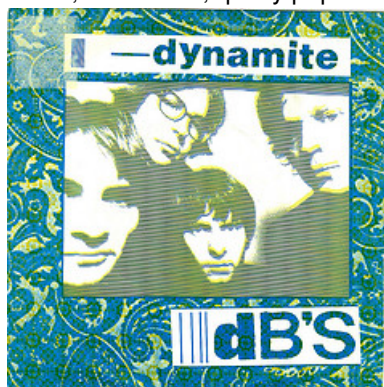
The cover of the dB's single for the song "Dynamite," on Albion Records, 1980.