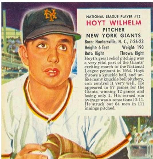
Red Man Tobacco. "Insert, Tobacco, Accession #: S.1977.11.181." 1955. North Carolina Historic Sites.

[5] The reduced pressure on his arm from throwing a slower pitch allowed him to appear in more games than other pitchers, but the erratic break led to catchers frequently leading the league in passed balls. Although Wilhelm recorded 15 saves in 1953, he did not see action in the game when he was voted to his first All-Star team that year due to concerns about the catchers' ability to handle his pitches.