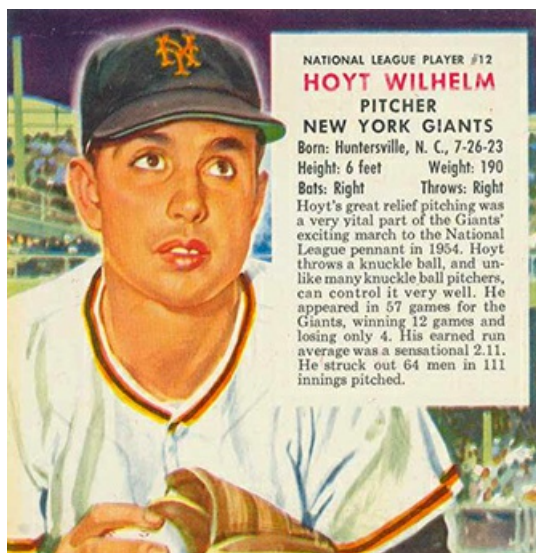
Red Man Tobacco. "Insert, Tobacco, Accession #: S.1977.11.181." 1955. North Carolina Historic Sites.

[5] The reduced pressure on his arm from throwing a slower pitch allowed him to appear in more games than other pitchers, but the erratic break led to catchers frequently leading the league in passed balls. Although Wilhelm recorded 15 saves in 1953, he did not see action in the game when he was voted to his first All-Star team that year due to concerns about the catchers' ability to handle his pitches.