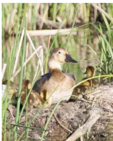
Hens nest over water in deeper prairie potholes, ponds, and

wing. Aside from its coloration, the canvasback is recognizable by its large, wedge-shaped bill and head. The drake canvasback has a chestnut-red head and neck, and black chest highlighted by its light gray back. The hen (female) has a buff-brown head and chest with a brownish-gray back. Immediately after hatching, both sexes have yellow eyes, but after 10 to 12 weeks the eyes begin to turn red. The wings of the hens are brown flecked with white. The males have nearly white wings with brown primary feathers.