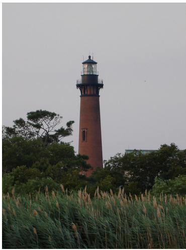
Mathus, Ryan. 2008. "Currituck Beach Light." Online at Flickr.

[35] The Coastal Plain forms the eastern edge of North Carolina, making up about 45 percent of the state's total land area. It is bounded on the east by the Atlantic Ocean [36] and on the west by the Fall Line, a broad zone where the soft rocks of the Coastal Plain meet the hard crystalline rocks of the Piedmont [7] . The Coastal Plain varies in width from 100 to 140 miles. It rises gently in elevation to the west, from about sea level at the coast to as much as 500 feet in the Sand Hills district.