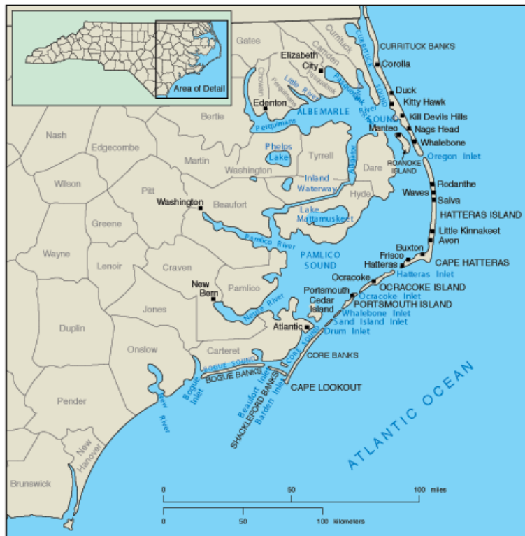
Figure 5. Major Coastline Features of the Outer Banks