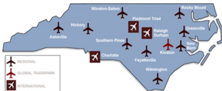
Figure 23. Commercial Airports

North Carolina's second tier of commercial airports includes airports with service by multiple carriers, and it includes Asheville, Wilmington, and Fayetteville. The third tier of airports that have a combination of commuter air service and general aviation are located in New Bern, Greenville, Jacksonville, Kinston, Rocky Mount/Wilson, Hickory, Southern Pines, and Manteo. These are airports with service primarily connecting with the three Tier One airports in the state and limited service to other cities. A current trend is for the so-called "low cost" airlines to initiate service in airports in all three tiers. Figure 23 shows the approximate locations of the primary airports in North Carolina. In addition to these commercial airports, there are approximately 60 public airfields that serve general aviation, and over 300 privately-owned, private-use airports. These smaller airports provide important travel mode options to many residents and visitors to the state.