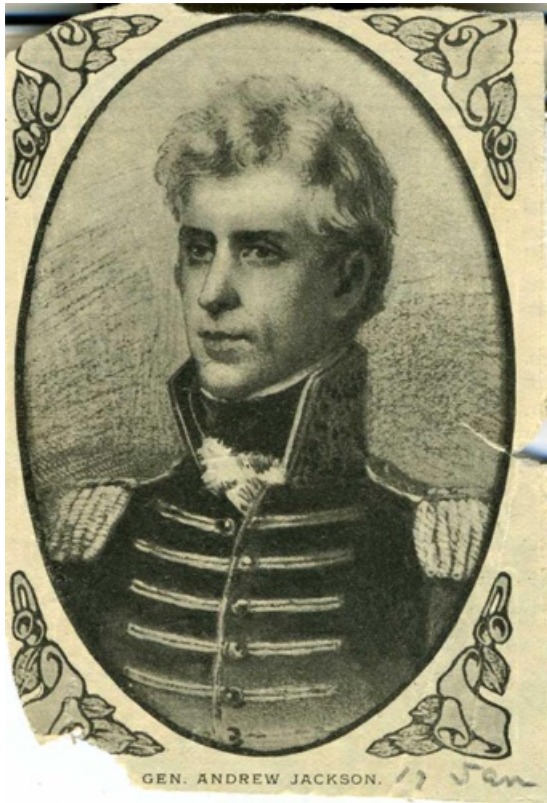
Clipping of a drawing of Andrew Jackson, circa 1900-1920. From the collections of the North