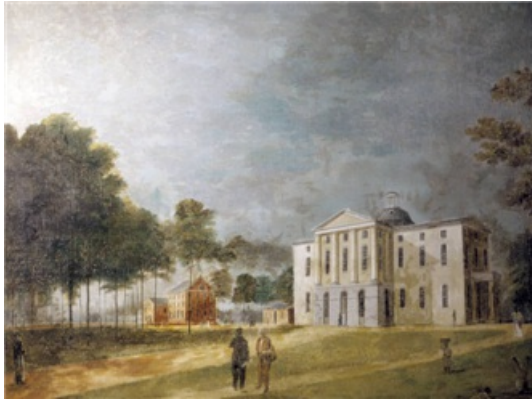
First Raleigh state house, by Jacob Marling, 1818

Raleigh [20] , famous explorer and founder of the Roanoke Colony [21] .