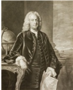
Arthur Dobbs, Engraved by James McArdell

View the main NCpedia entry about Raleigh. [2]