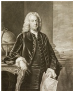
Arthur Dobbs, Engraved by James McArdell

View the main NCpedia entry about Raleigh. [2]