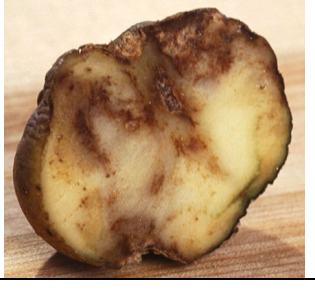
Figure 1: A Late Blight Infected Potato Tuber